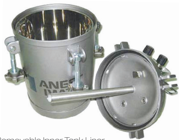
Removable Inner Tank Liner in Stainless Steel