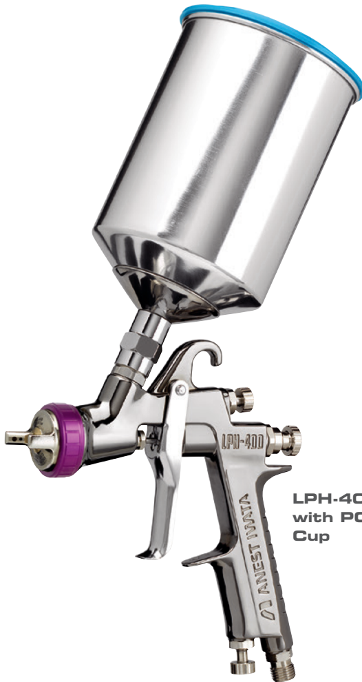
LPH-400-LVB with PCG7EM Cup